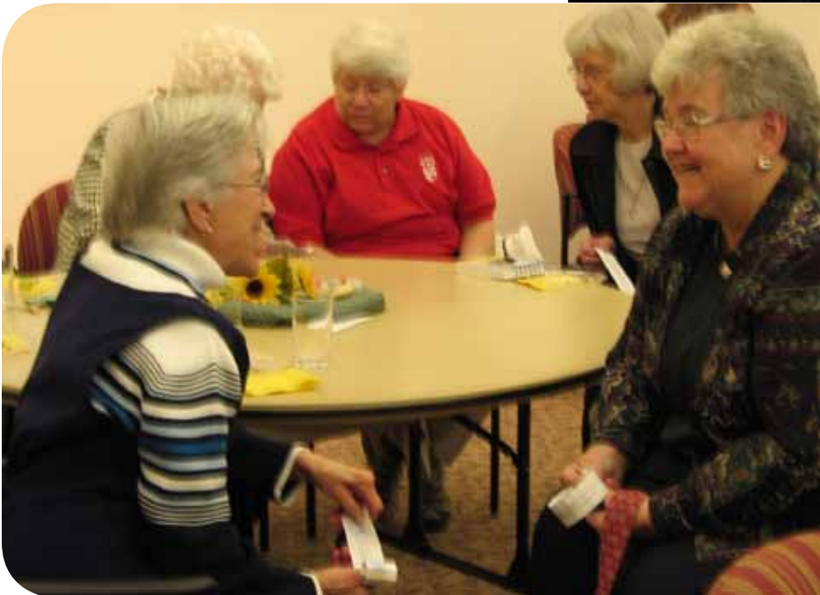
Blessings shared around the table at the Blessing upon Blessing launch party.