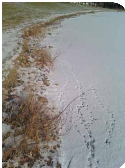
Shepherd’s Corner in winter

Help The Spirituality Network when you purchase The Return of the Prodigal Son: A Story of Homecoming via the Amazon purchase program at the Network website: http://tinyurl.com/cp5yv9d